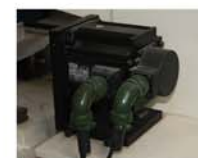
松下伺服电机 Panasonic servo motor