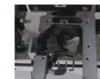
自动剪线 Automatic thread trimmer