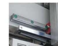
台湾直线导轨 Taiwan linear guide