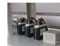
松下伺服驱动器 Panasonic servo driver